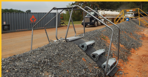
Doesn't Rise Above Ground

Office: (936) 715-9488 Fax: (936) 715-9480 Email: theflexstep@yahoo.com www.theflexstep.com