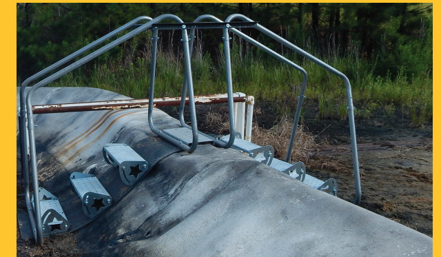
Each Step Individually Adjusts

Distributed Through All Suppliers. Have Your Supplier Contact Us.