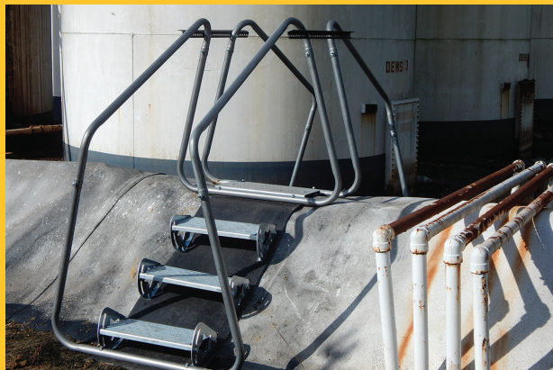
Will Not Penetrate Liner