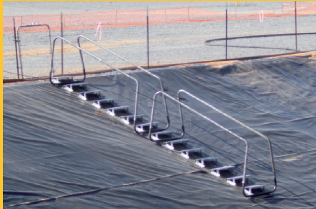
All Lengths Available