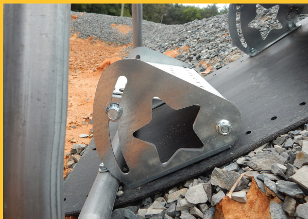
Any Slope Combination 0-50° Adjustment